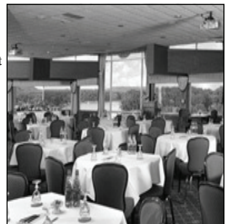
New Beginnings' 2nd Annual Fall Banquet Fundraiser will be held at the historic St. James Hotel in the Summit Room.